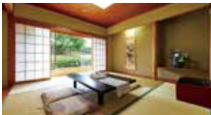
Japanese Room (8 tatami mats)