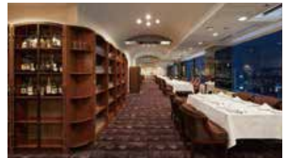
12F スカイバンケット