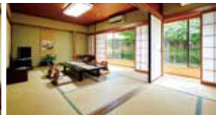
Japanese Room (10 + 4 tatami mats)