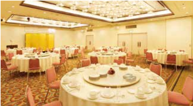
2F Royal Prince

We are able to cater to the needs of our guests for any occasion, from elegant banquets to casual parties. In addition to the banquet room, there are also four meeting rooms available for use.