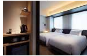
Corner Twin (Universal Design)