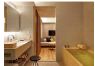
Premier Double (with hinoki bath)