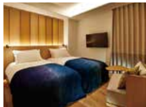
Deluxe Twin (with hinoki bath)