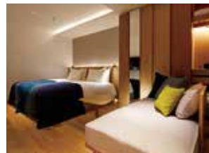
Premier Twin (with hinoki bath)