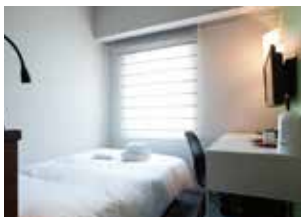
Standard Semi Double