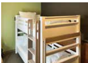
Superior Bunk Bed