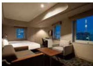
Premium Sky Twin