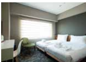
Premium City Twin