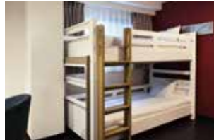
Standard Bunk Bed