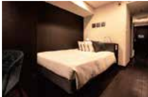
Standard Double with Bathtub